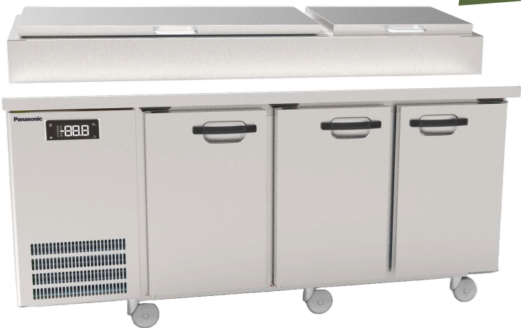
PIZZA/SALAD PREP BENCH SUR-1871HPZ-(AUH)