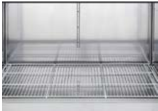
Round corners for easy cleaning