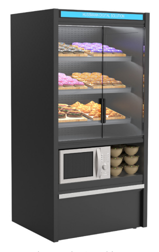
(Concept drawing only)